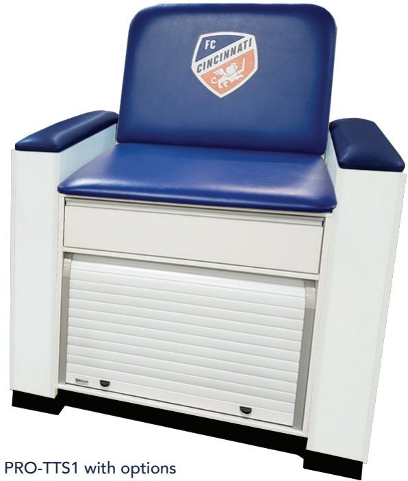
PRO-TTS1 with options