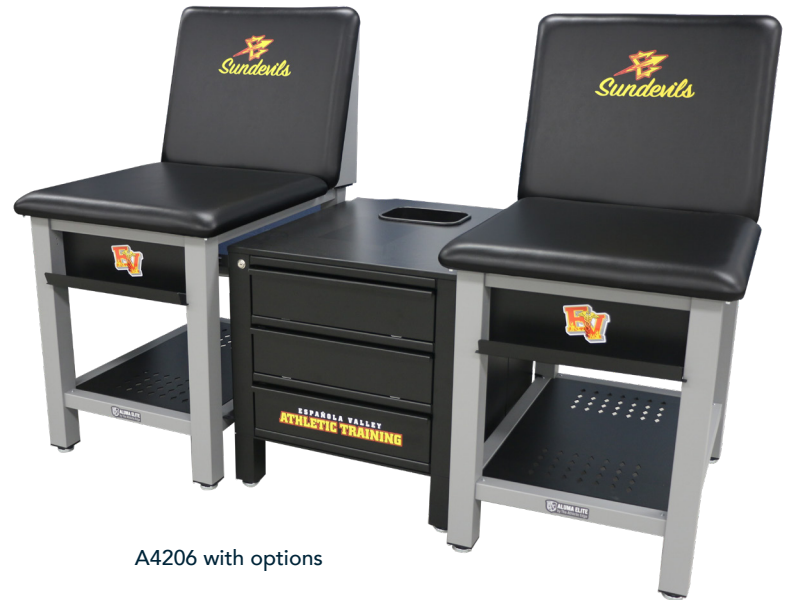
A4206 with options