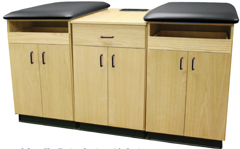
2 Seat Flat Taping Station with Options