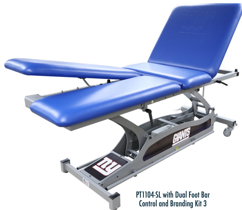
PT1104-SL with Dual Foot Bar Control and Branding Kit 3