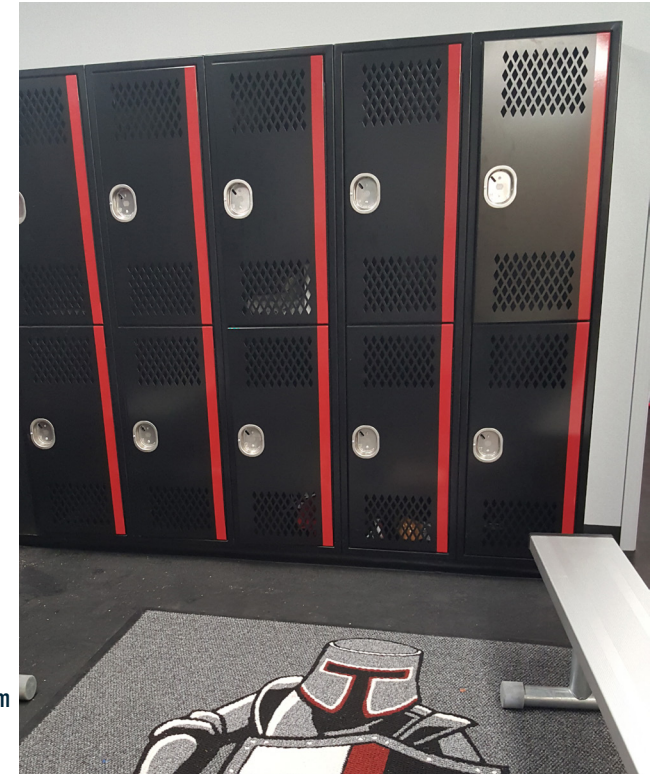
2 Tier with Custom Louvers