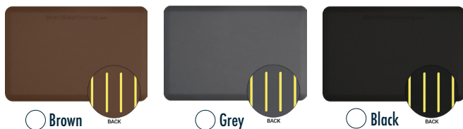
Brown Grey Black