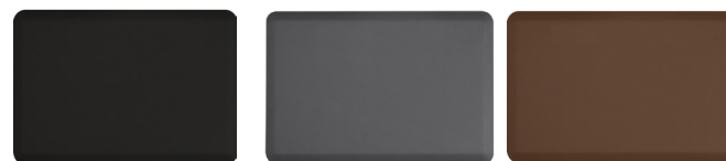
Black Grey Brown