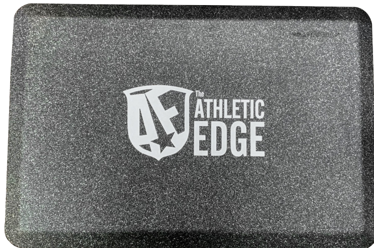
M032 with Center Logo